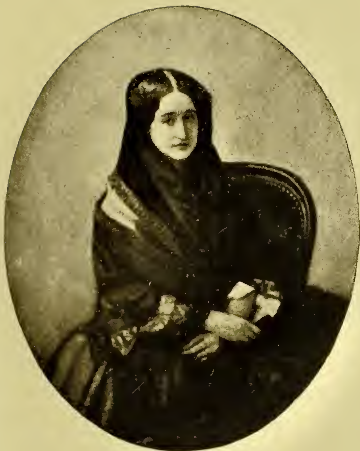
MADemoiselle EUGÉNIE -COMTESSE DE TÉBA. From a photograph taken in 1852.